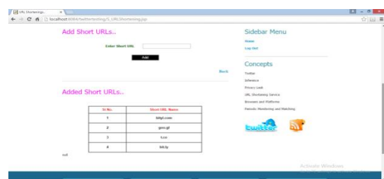
Figure 1. Adding URLs